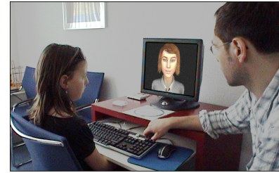
Figure 1: Participant during a DECT session.

DECT has been conceived as an interactive research tool, rather than as an intervention tool, where both experimenters and participants can work in a real-time environment. Currently, the interaction with the software has been designed in a way where the experimenter has more control over it. It is the experimenter who explains the child or adolescent what it needs to be done, and even aids him in the selection of the emotional choice, as seen in Figure 1.